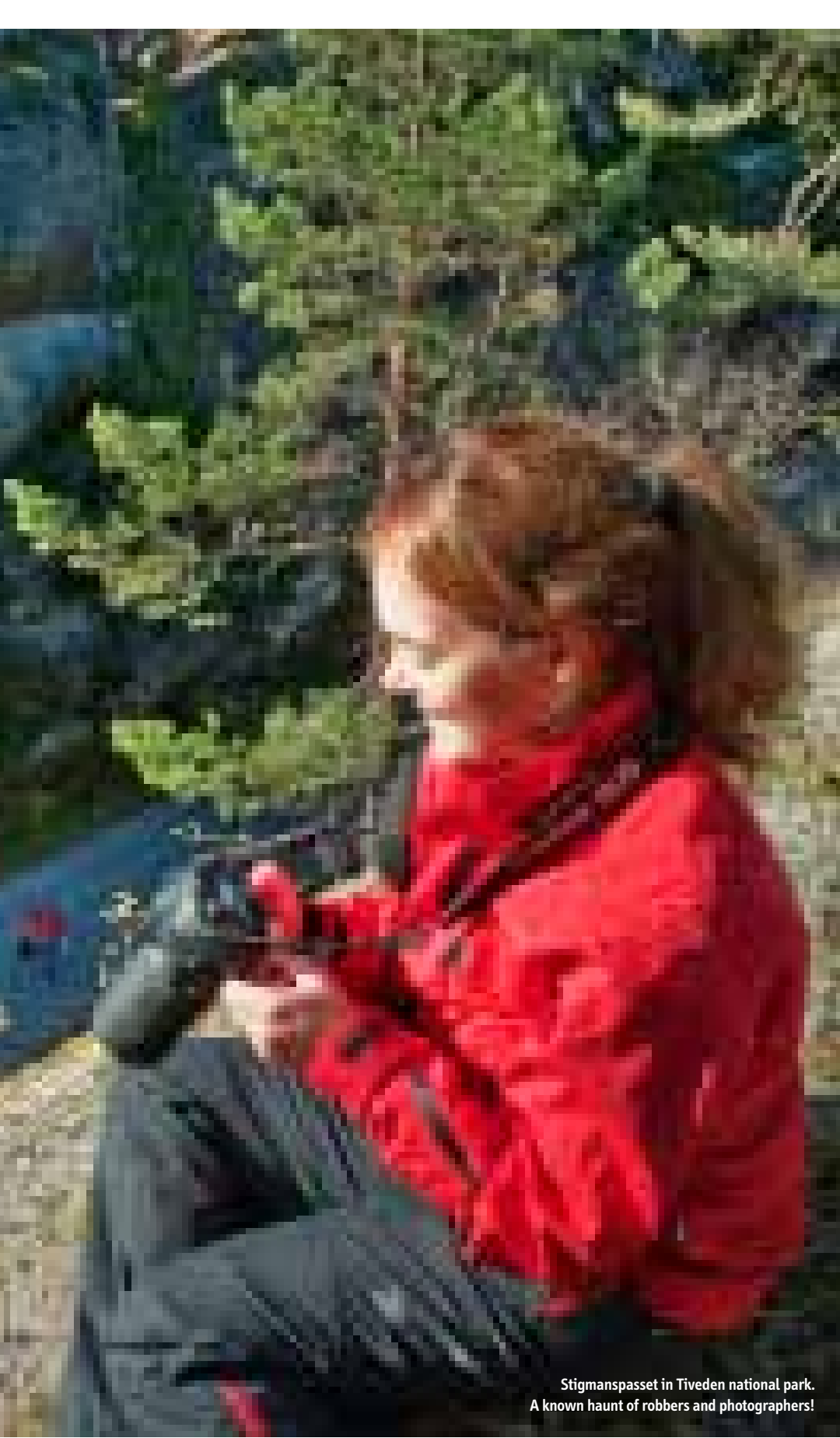
Stigmanspasset in Tiveden national park. A known haunt of robbers and photographers!