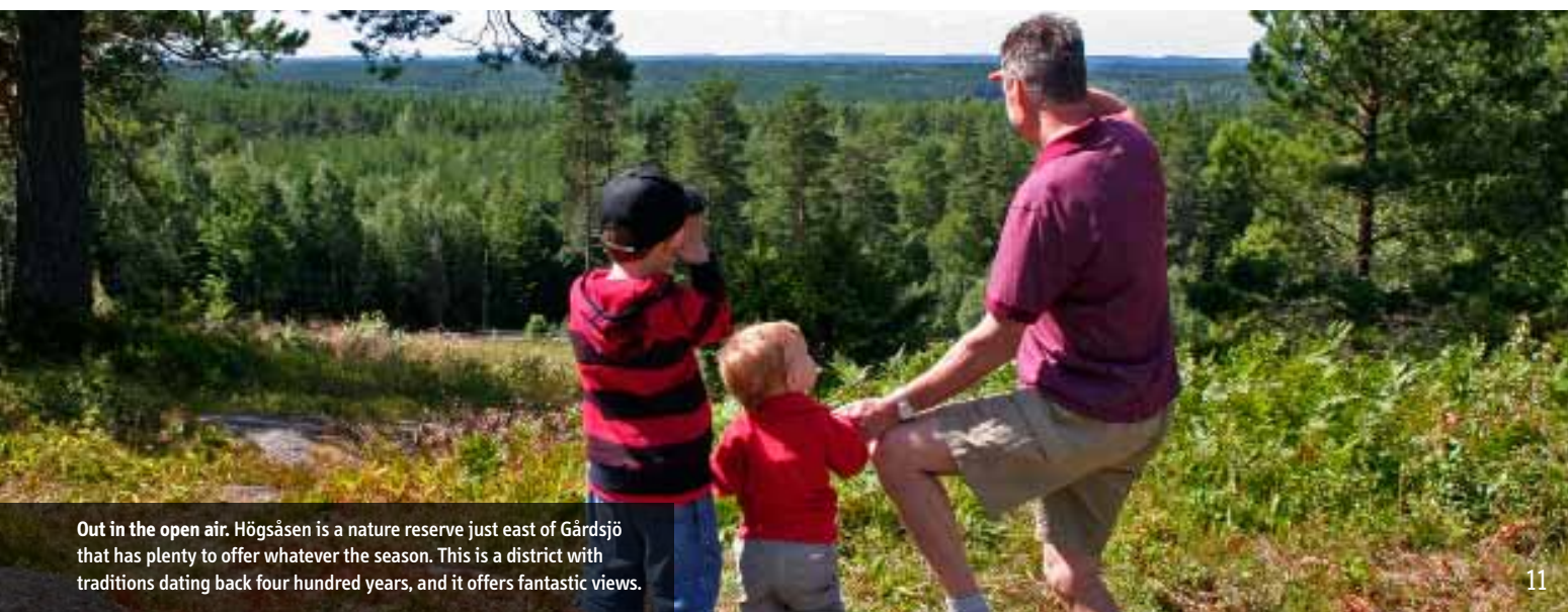
Out in the open air. Högsåsen is a nature reserve just east of Gårdsjö that has plenty to offer whatever the season. This is a district with traditions dating back four hundred years, and it offers fantastic views.