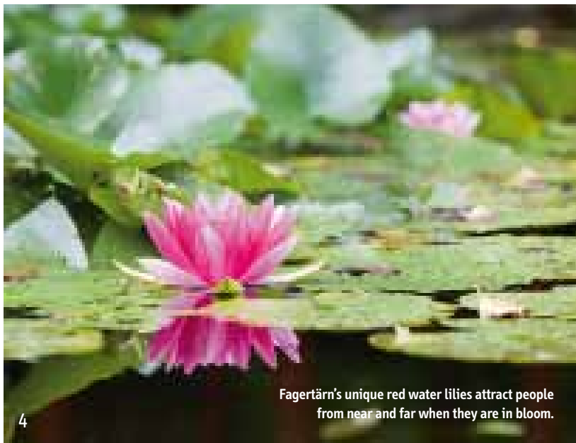
Fagertärn's unique red water lilies attract people from near and far when they are in bloom.

But Tiveden offers much more than that. Several protected conservation areas, spread out over the whole of this forest region (see visitors' map), contribute to the rich experience of nature.