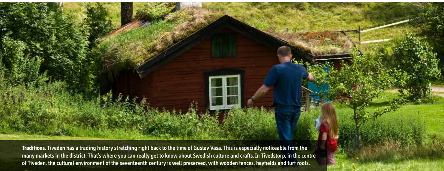
Traditions. Tiveden has a trading history stretching right back to the time of Gustav Vasa. This is especially noticeable from the many markets in the district. That's where you can really get to know about Swedish culture and crafts. In Tivedstorp, in the centre of Tiveden, the cultural environment of the seventeenth century is well preserved, with wooden fences, hayfields and turf roofs.