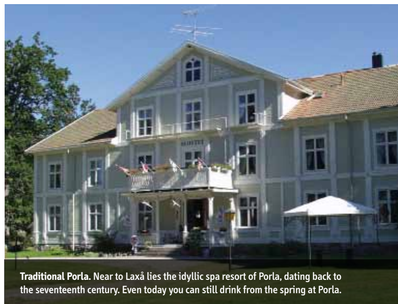
Traditional Porla. Near to Laxå lies the idyllic spa resort of Porla, dating back to the seventeenth century. Even today you can still drink from the spring at Porla.