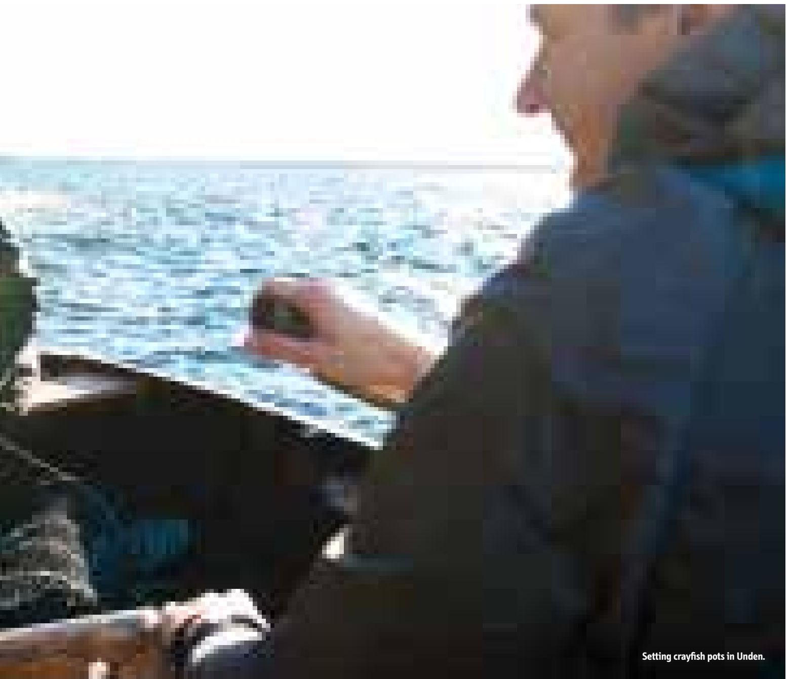
Setting crayfish pots in Uden.